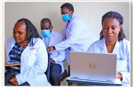
Health Professions Education