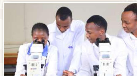
Medical Laboratory Sciences