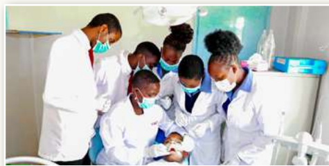
Community Oral Health