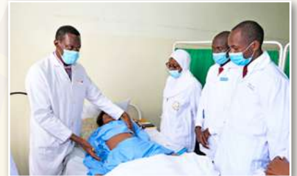
Clinical Medicine and Surgery