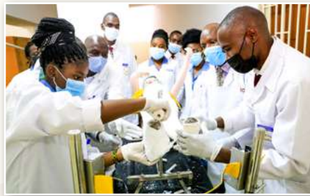
Orthopaedic and Trauma Medicine