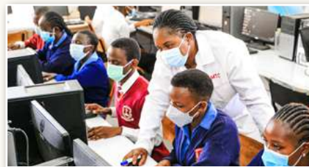
Health Records and Information Technology