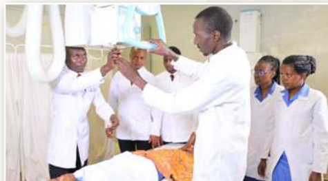
Radiography and Imaging