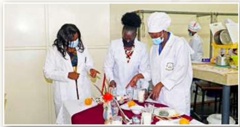
Nutrition and Dietetics