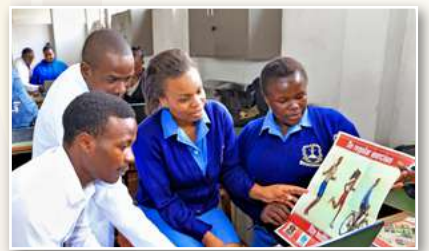
Health Promotion and Community Health