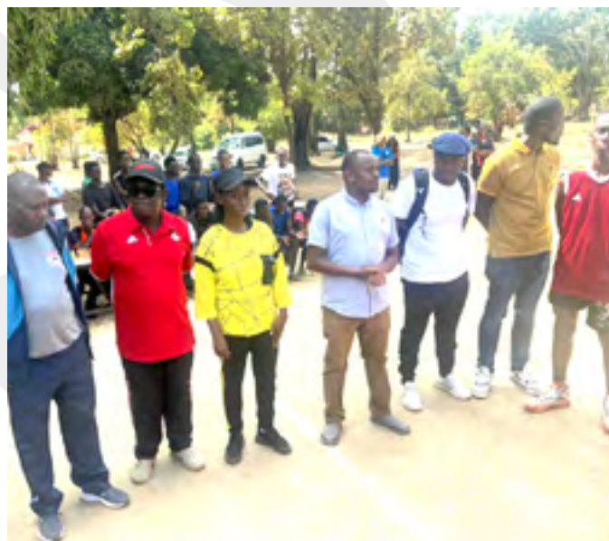
Zone 2 Sports competition in Kitui.

Teams that qualify at the zonal level will proceed to compete at the next level.