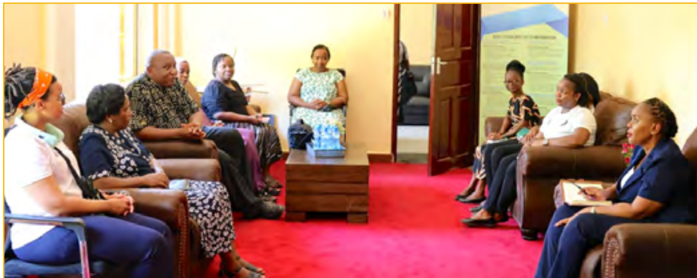
Beyond Zero team and KMTCC courtesy call to Deputy Governor Kilifi County March 18, 2025.