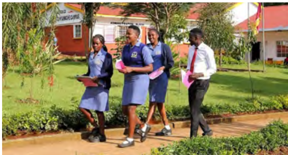
A section of KMTC Students [file photo].

T he Kenya Medical Training College students can now breathe a sigh of relief following the Government's reinstatement of the Higher Education Loans Board (HELB) sponsorship program.