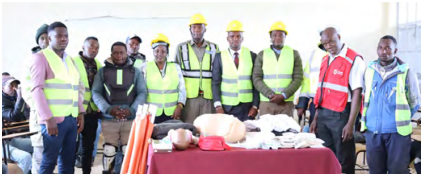
Stakeholders during a training in Nyandarua Campus.

It is not uncommon for medical colleges to offer training in life-saving skills needed during emergencies. But what if such training is extended to boda boda riders?