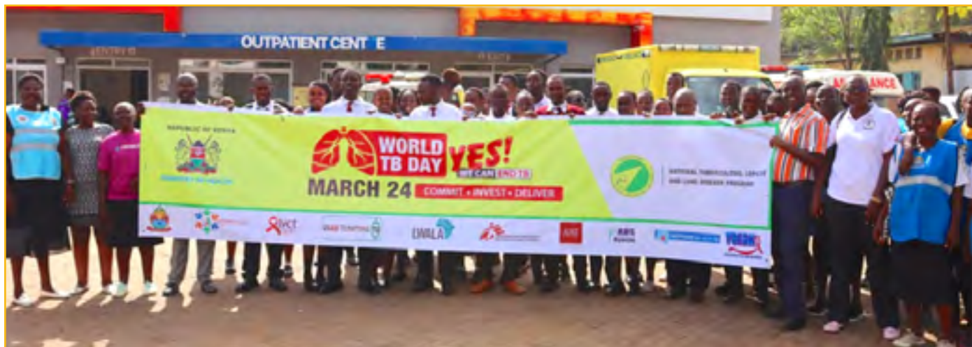
Homabay Campus on March 24, 2025 during the World Tuberculosis Day.