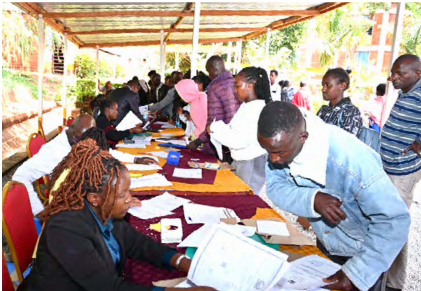
Machakos Campus during the March 2025 admission.

T he College marked a significant milestone on March 18, 2025, as thousands of first-year students reported to various Campuses across the country, officially beginning their journey in medical training.