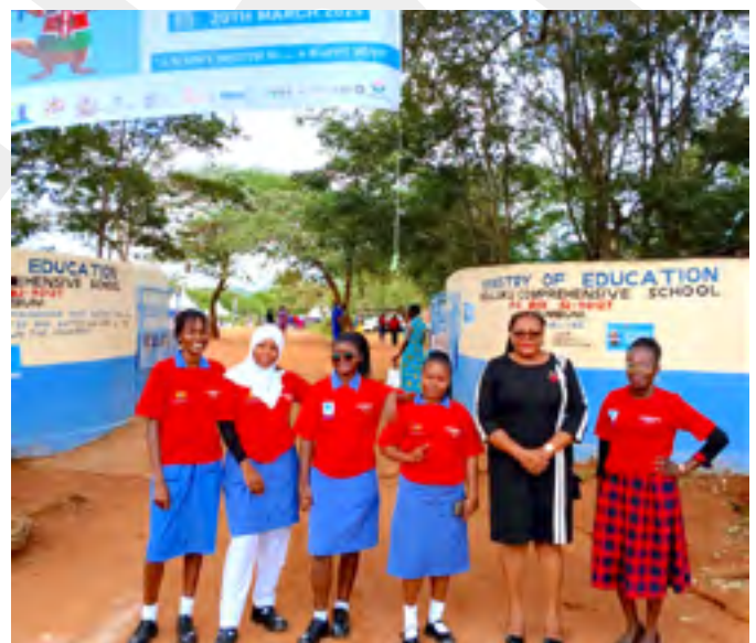
Mbooni Campus during World Oral Day celebrations in Makueni County.