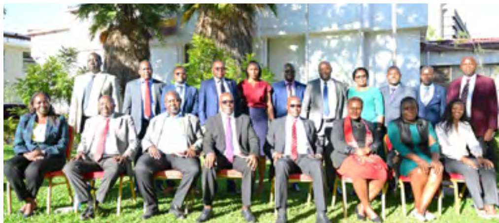
A section of the Board of Directors, Management and the newly elected leaders of the Principals Forum

In a significant move to strengthen academic leadership and enhance the quality of training at the Kenya Medical Training College (KMTC), Principals from various campuses gathered in Nairobi for a four-day academic council forum. The meeting, which commenced on March 24, 2025, at the KMTC Nursing Hall, served as a platform for key discussions on academic policies, institutional growth, and strategies to improve teaching and learning across the College.