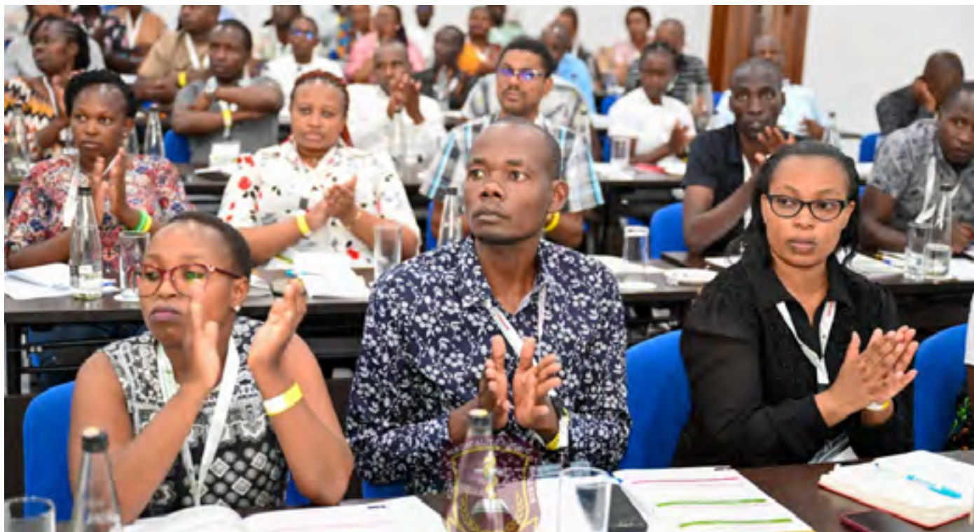
A section of participants and members of the Ophthalmic Clinical Officers Association during their annual Conference in Malindi.

A s the College marks a century of excellence, its impact on the ophthalmic sector continues to shape the future of eye care by equipping professionals with the expertise to serve communities across the country and beyond. This year's Annual Ophthalmic Clinical Officer Association Conference, held at Diamonds Hotel in Malindi from March 5th to 7th, 2025 provided a platform for KMTC to showcase its legacy as a globally competitive institution dedicated to training human resources for health.