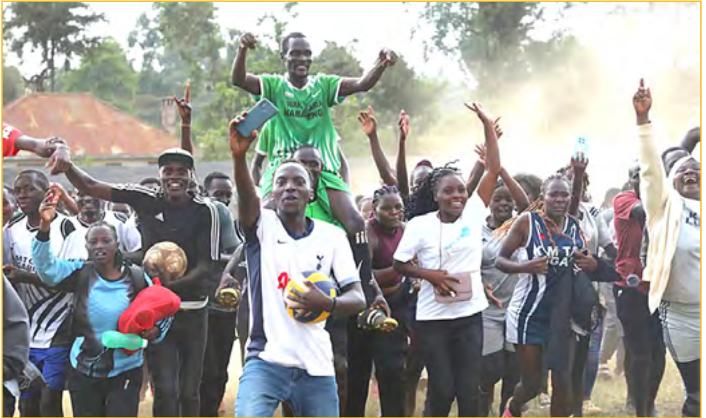
Zone 6 KMTC Sports Competition at Kakamega School.