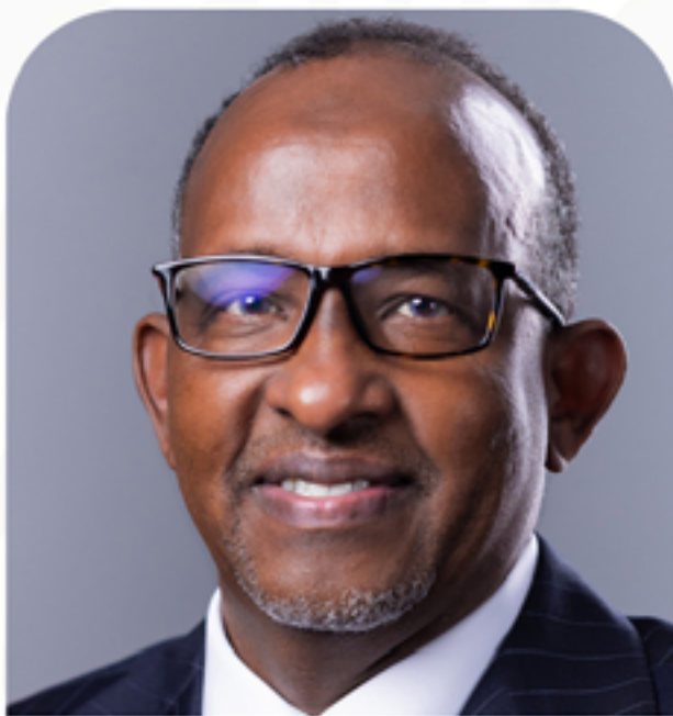
Hon. Aden Duale, E.G.H. Cabinet Secretary, Ministry of Health

The Board of Directors, Management, Staff, and Students of Kenya Medical Training College (KMTC) congratulate Hon. Aden Duale, E.G.H. on his appointment as Cabinet Secretary, Ministry of Health. We wish you all the best as you serve our great nation of Kenya. Congratulations!