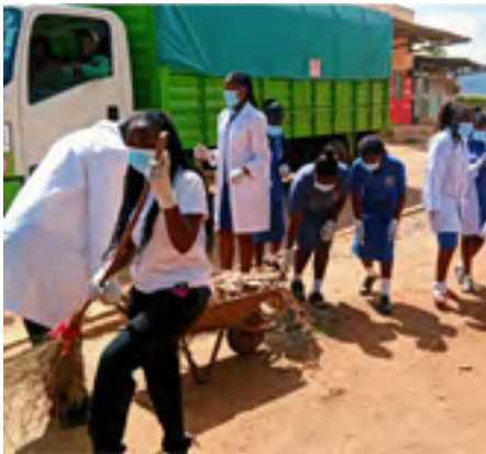
Mbooni Staff during a cleanup exercise.