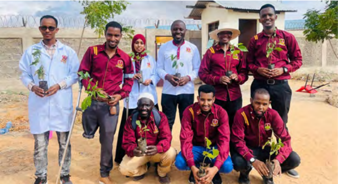
Garissa Campus prepares for tree growing.