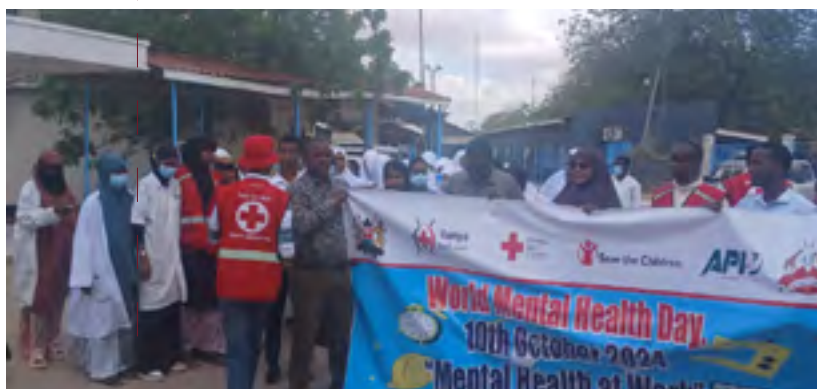
Wajir Campus during the World Mental Day.