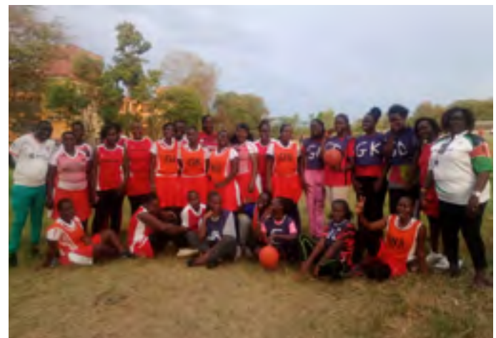
On October 16, 2024, Homabay Campus hosted the Homa Bay County Assembly sports team, along with Nyumba Kumi neighbors and Kenya Prisons, for friendly competitions.