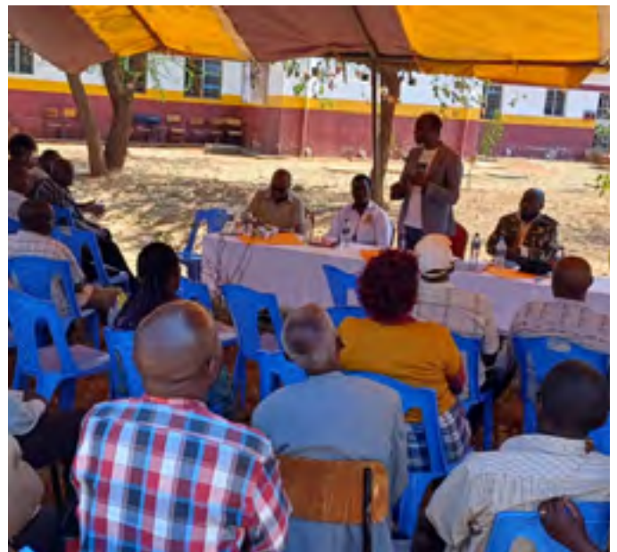
Stakeholders during a meeting at Mbuvi Campus on October 17, 2024, to discuss various areas of collaboration.