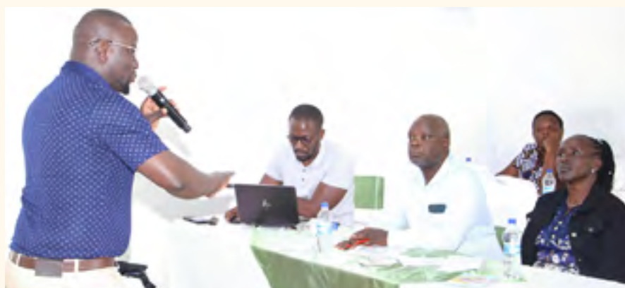
Resource Mobilization and Partnership Manager making his address during the workshop.

"Without adequate resources, the College cannot operate effectively or achieve its ambitious goals," he said. Adding that: "We are focusing on intensifying our resource mobilization efforts by exploring income-generating activities and optimizing fee collection to secure the additional funds required."