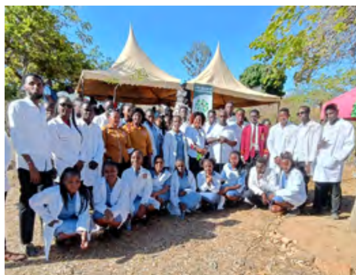
CSR: Kitui Campus at Vinda in Miambani Ward for a medical camp on October 31, 2024.