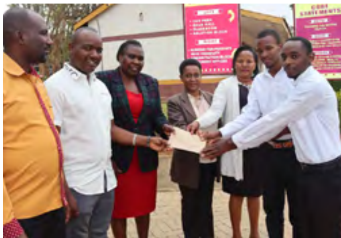
Kitui Campus Class of 04 Alumni during their visit to the Campus.