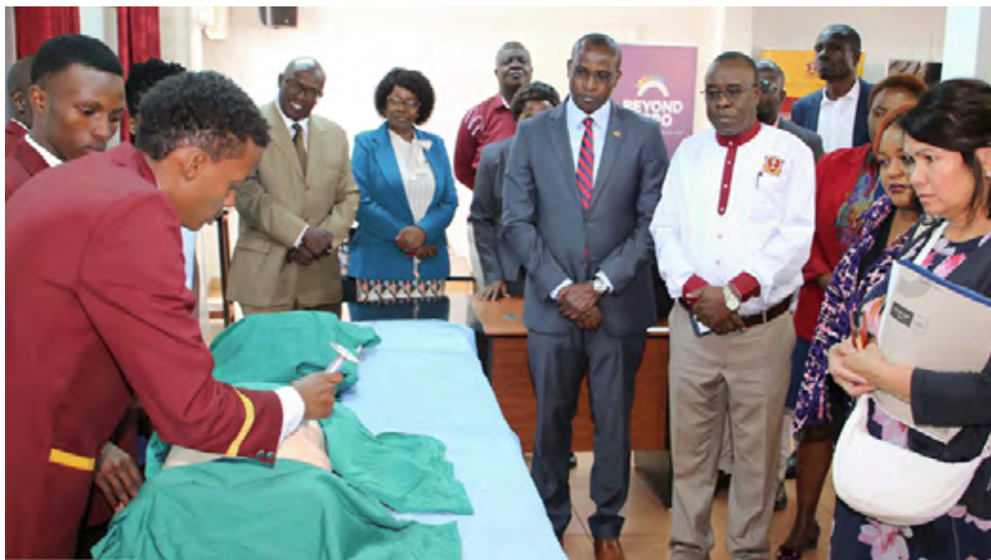
Roche and Beyond Zero-Sponsored ASAL Students showcase skills during the visit.

O n October 4, 2024, the College welcomed a high-level delegation from Roche and Beyond Zero as part of an ongoing partnership to support the Enrolled Community Health Nursing (ECHN) Programme.