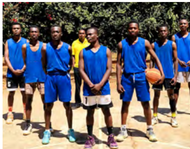
Manza Campus Basket Ball team played with Scott University at Kawayia Stadium in Machakos County, and won 85-59.