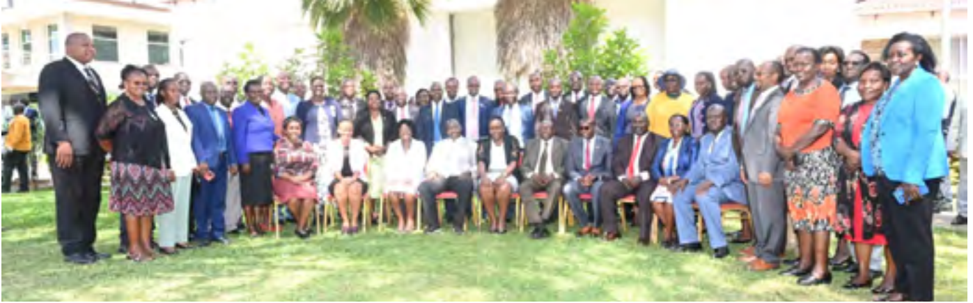
A section of the KMT Academic Council members during a five-day meeting held at the Nairobi Campus Nursing Hall from October 28, 2024.