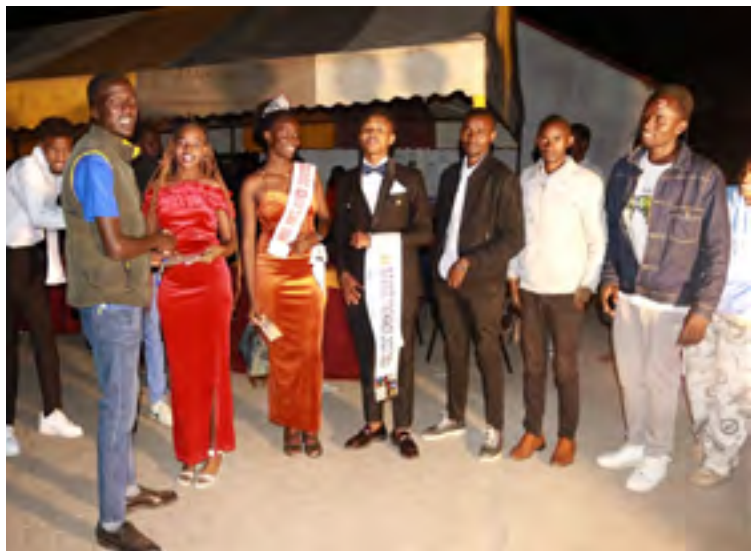
Manza Campus crowned the Alumni Day with a contest of Mr. and Miss KMTC Manza.