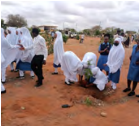
Wajir Campus during a tree growing exercise.