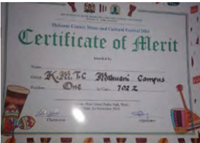
Win for Makueni Campus at the County Music and Cultural Festival 2024.