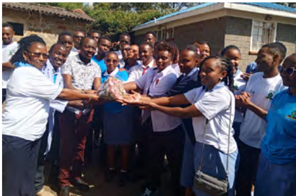
Murang'a Campus staff and students during the event.