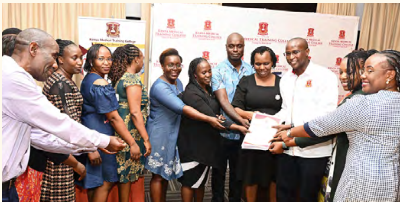
Human Resource Division receives Team of the Year award.

O n October 9, 2024, the College held its fifth Staff Reward and Recognition Ceremony in Kisumu, to honor the outstanding achievements and commitment of its staff.