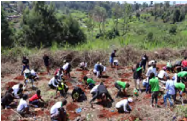
Nyeri Campus plants trees donated by Green Space/AAR.