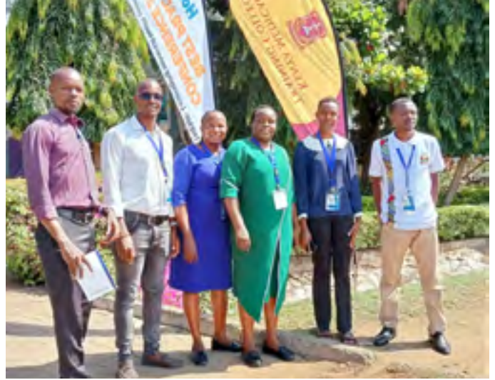
Homa Bay Campus staff during the Homabay Best practices Conference on 31st October, 2024.