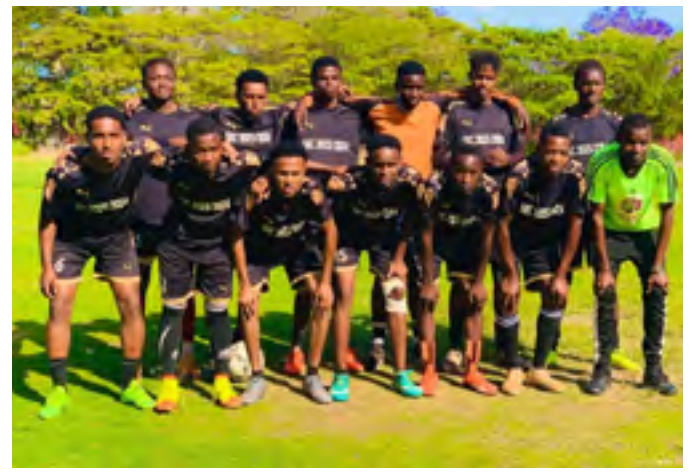
Manza Campus Foot Ball team during a match at Kawayia Stadium.