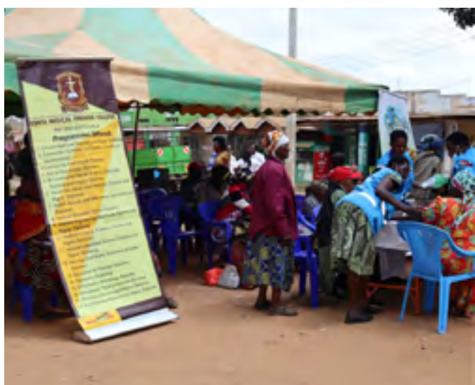
CSR: Mbooni Campus pitched a medical camp in the community on October 10, 2024.