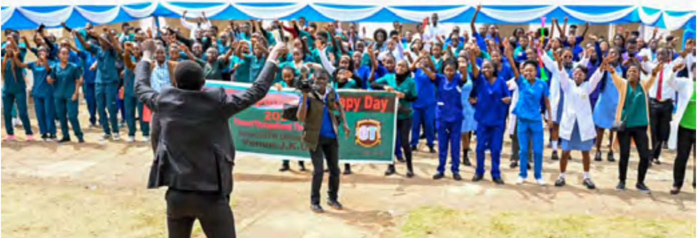
Staff and students during the World Occupational Therapy day celebrations held at JKUAT on October 28, 2024.