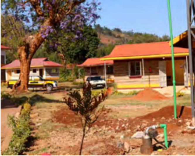
A borehole at Meru Campus (Miathene Satellite) drilled with the support of Tigania west NG-CDF.