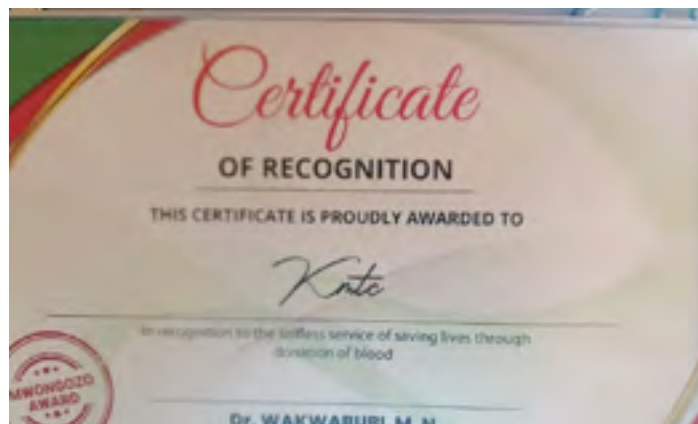
CSR: Wajir Campus fraternity participated in a blood drive aimed at supporting local hospitals and saving lives within the community.