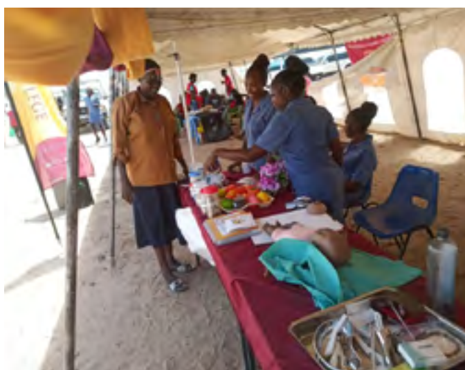
Lodwar Campus at the 2024 Turkana Tobongu'lore Cultural Festival.