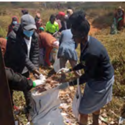
Marsabit Campus cleaning up exercise.