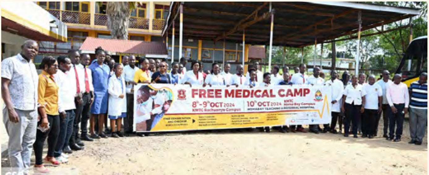
Staff, students and medics during the medical camp.

T he College, in partnership with the Homa Bay County Government and various non-governmental organizations, organized a free medical camp that brought much-needed healthcare services to the people of Homa Bay and Raichuonyo. The medical camp, which attracted over 1,000 residents, offered a wide range of services such as general health check-ups, cancer screenings, dental care, eye surgeries, and health education.