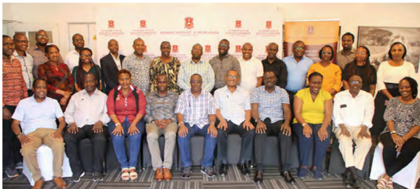
KMTC Board Directors, Management, Staff and UMI Project Staff during the workshop in Kisumu.

T he Board of Directors and Senior Management engaged in a comprehensive series of activities from October 7 to 11, 2024, in Kisumu, focusing on strengthening leadership capacity and advancing the institution’s teaching and learning framework.