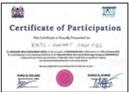
Marsabit campus was awarded for their efforts in environmental sustainability.