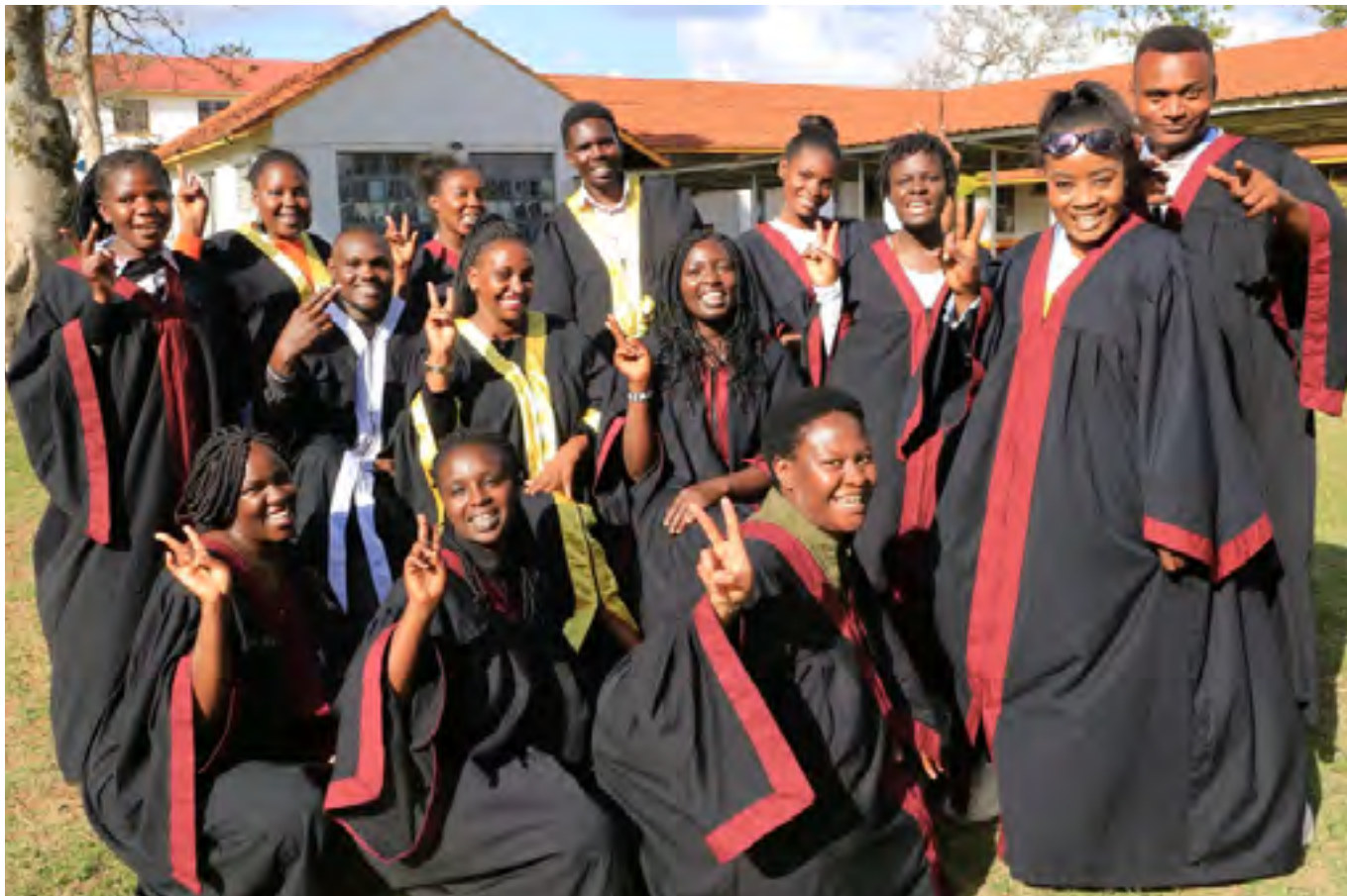
FILE PHOTO: KMTTC students during a past graduation ceremony.

T he College is gearing up to celebrate its 93 rd graduation ceremony on December 5, 2024, at Moi International Sports Center, Kasarani. This year's theme, "Developing a Fit-for-Purpose Health Workforce for the Achievement of Local and Global Health Goals," reinforces KMTTC's critical role in strengthening healthcare.