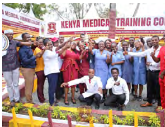
Mombasa Campus team during the 2024 Mombasa International Trade Fair, 2024, where the College scooped two prestigious awards - Best Tertiary Education Institution Stand (Other than University Category), and third Place for Display and Services in the Health Sector and Pharmaceuticals Standards.