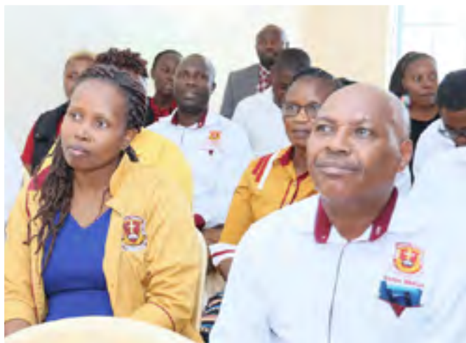
A section of Staff during a Member Education and Sensitization Training.

T he College has conducted a nationwide member education and sensitization training to enhance awareness of retirement and pension schemes, as well as the recent developments within the sector.