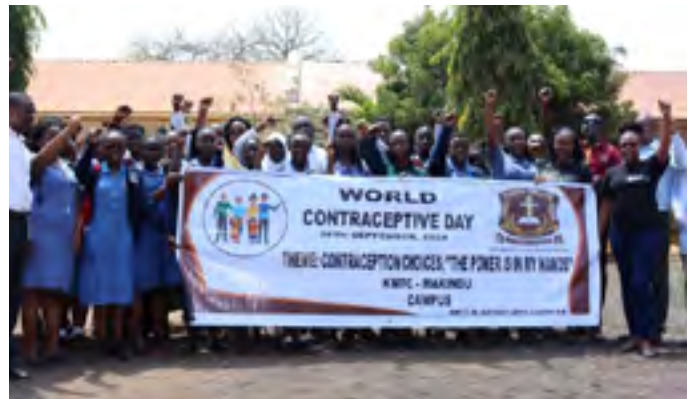
Makindu Campus during the World Contraception Day