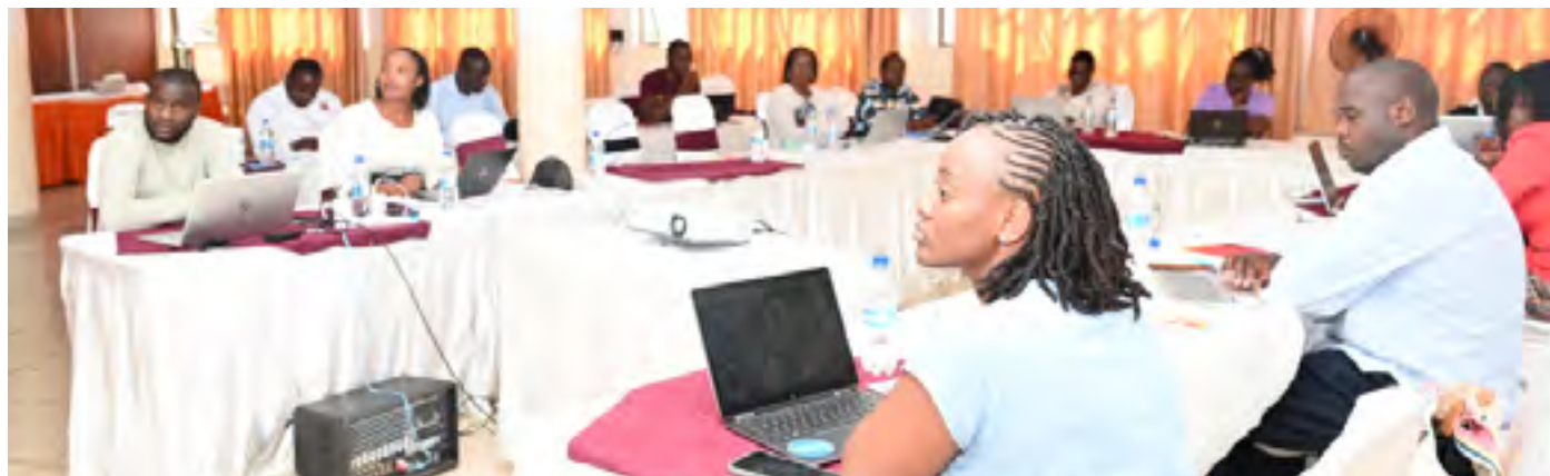
Staff during the Citizens Service Delivery Charter review workshop.

T he College is reinforcing its commitment to efficient, customer-focused service delivery with the ongoing review of its Citizen's Service Delivery Charter. This latest phase of review, concluded on September 27, 2024, in Kisumu, marks a significant step toward improving the efficiency and timeliness of services provided to the public, reflecting the College's dedication to service excellence.