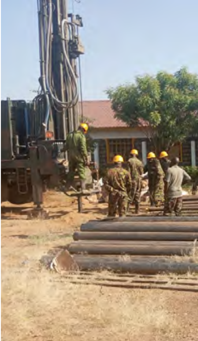
Borehole drilling at Chemolingot Campus.