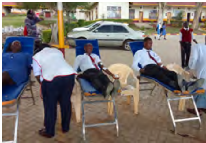
CSR: Webuye Campus in collaboration with Webuye County Hospital, during a blood donation drive.