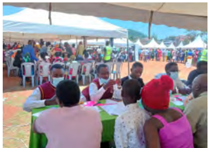
CSR: Kisii Campus in partnership with the Zuri M-PESA Foundation, the County Government of Kisii, and the Lions Eye Care Foundation organized a medical camp aimed at providing essential health services to underserved communities in Kisii County. The event saw remarkable outcomes, with over 3,000 individuals receiving medical attention.