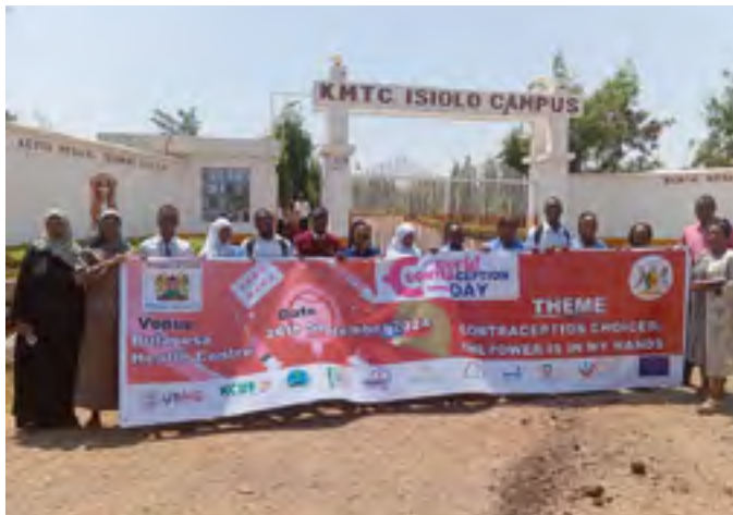
Isiolo Campus during the World Contraception Day