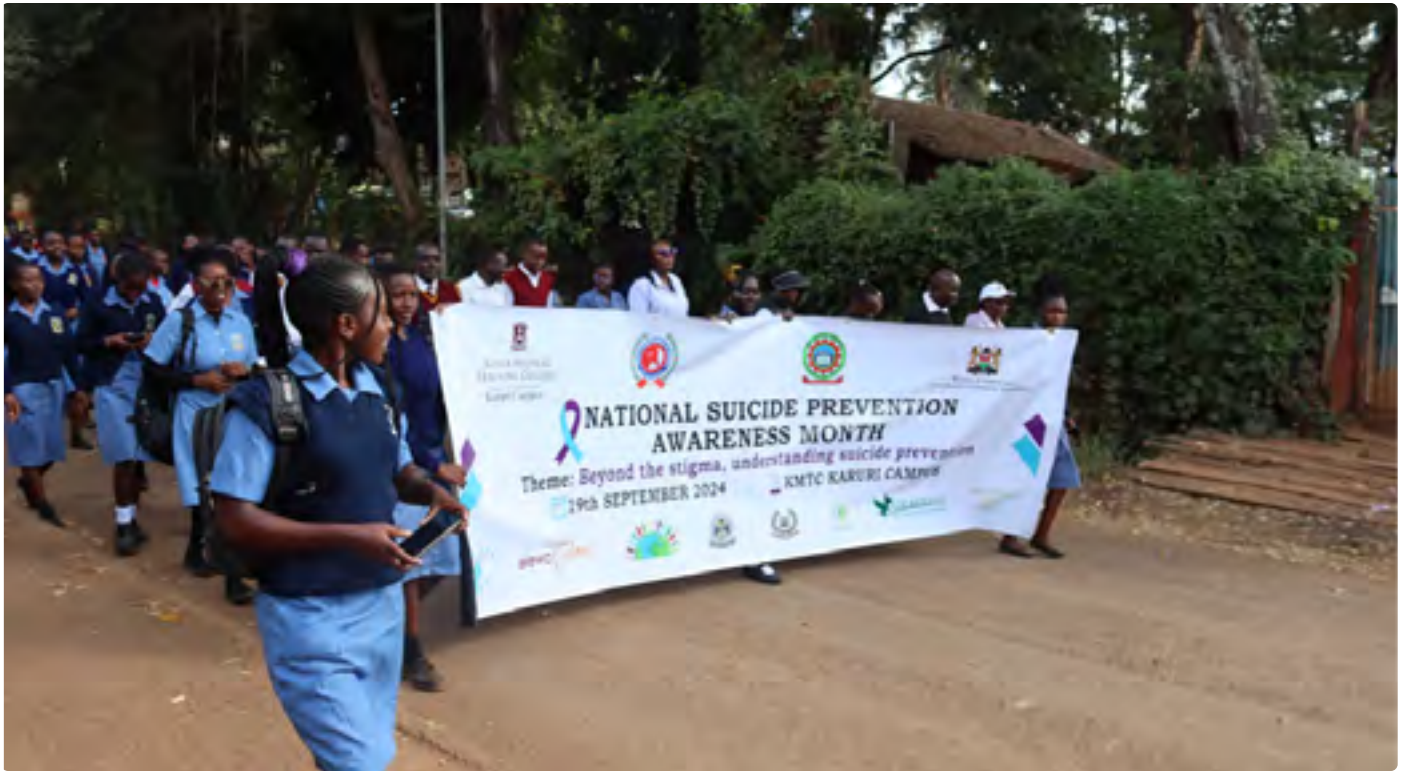
Karuri Campus Staff and Students during the event.

O n September 19, 2024, Karuri Campus, in collaboration with the Ministry of Health, the County Government of Kiambu, and Jomo Kenyatta University of Agriculture and Technology (JKUAT), marked National Suicide Prevention Awareness Month with a series of impactful events. The observance coincided with global efforts to promote mental health, aligned with World Suicide Prevention Day (September 10), which underscores the importance of proactive intervention and support in preventing suicide.