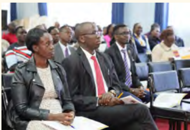
Members of the scheme following the member Education session.