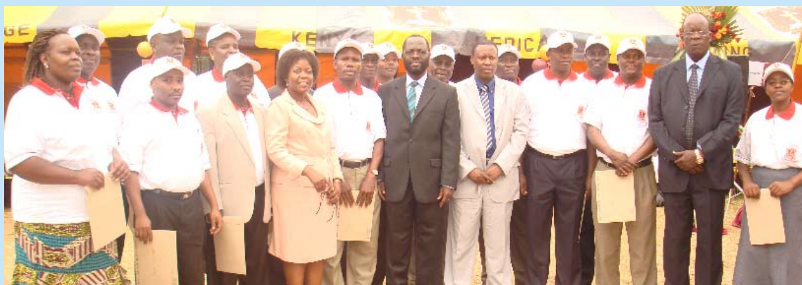
Members of the ISO Certification Committee, which has now drawn up an action plan for audits to maintain standards.

The Technical and implementation committee has now drawn a plan of action for surveillance audits to ensure that the system is maintained and the changes do not result in deficiencies in the system.