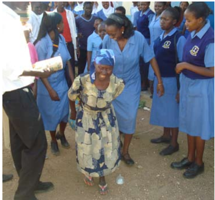
Some KMTCC students escort a happy lady after donating to her free food.