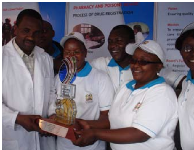
They couldn't hide their joy at being the best at the Kenya Public Service Week, 2009, at KICC, Nairobi.