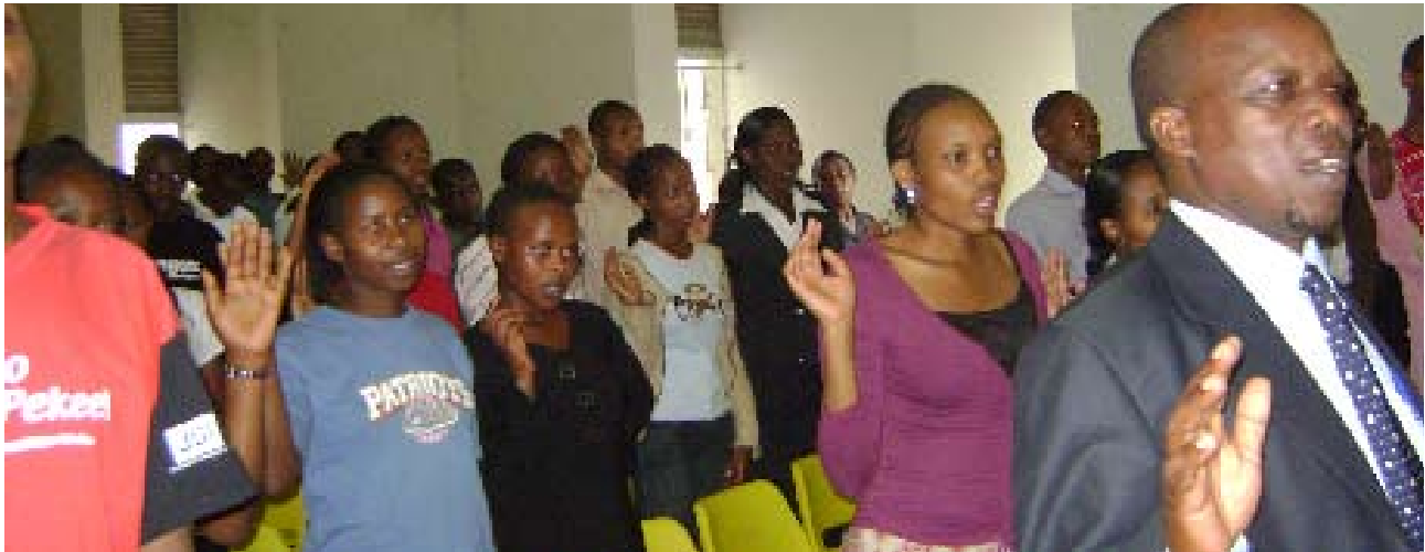
Some of the participants at the conference pledge to live a drugs-free life.

Close to 400 KMTCC students and staff were beneficiaries of this year's conference on drugs and substance abuse held in Nairobi on April 18, 2009 to discuss the dangers posed by drug abuse in institutions of higher learning.