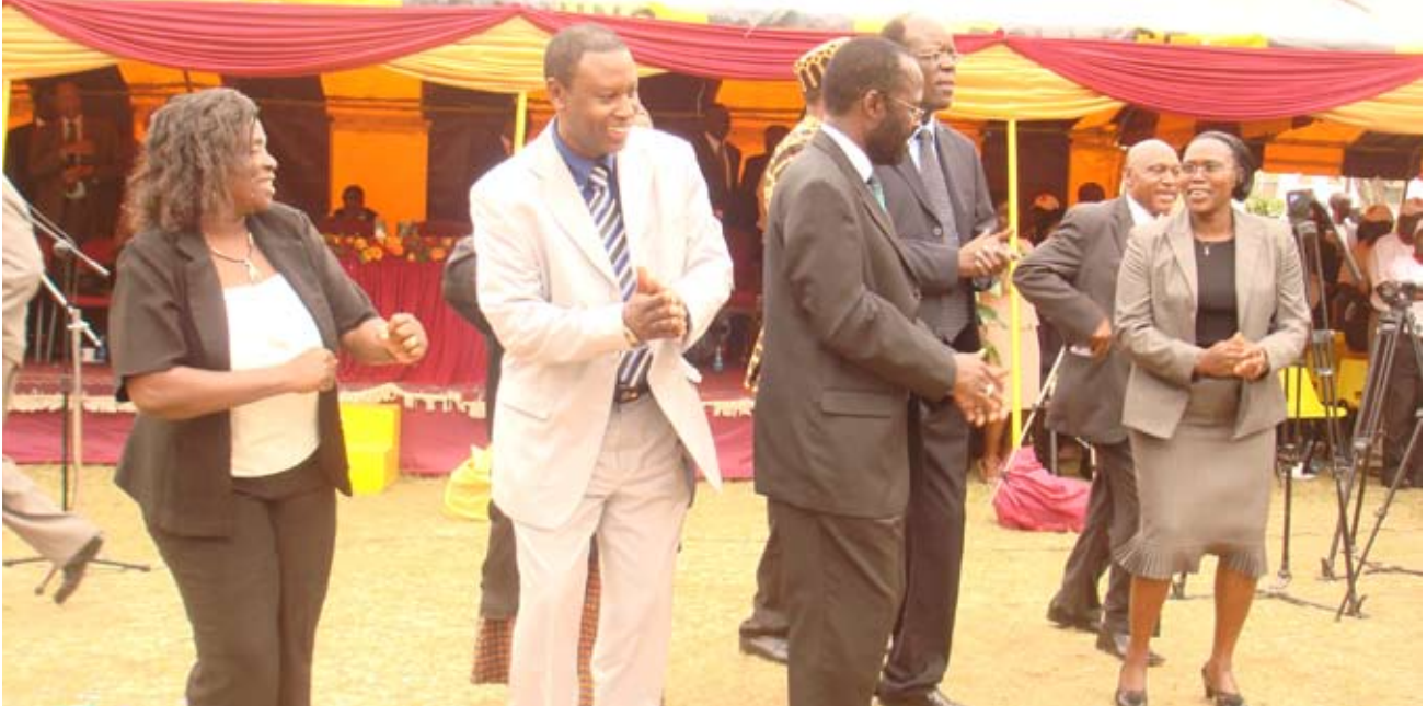
Some of the KMTTC Board members join the Minister in a dance to celebrate launch of the ISO Certificate on July 31.