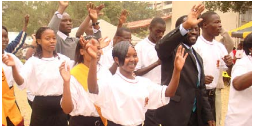
Medical Services Minister Prof. Nyong'o leads students to celebrate the certification.