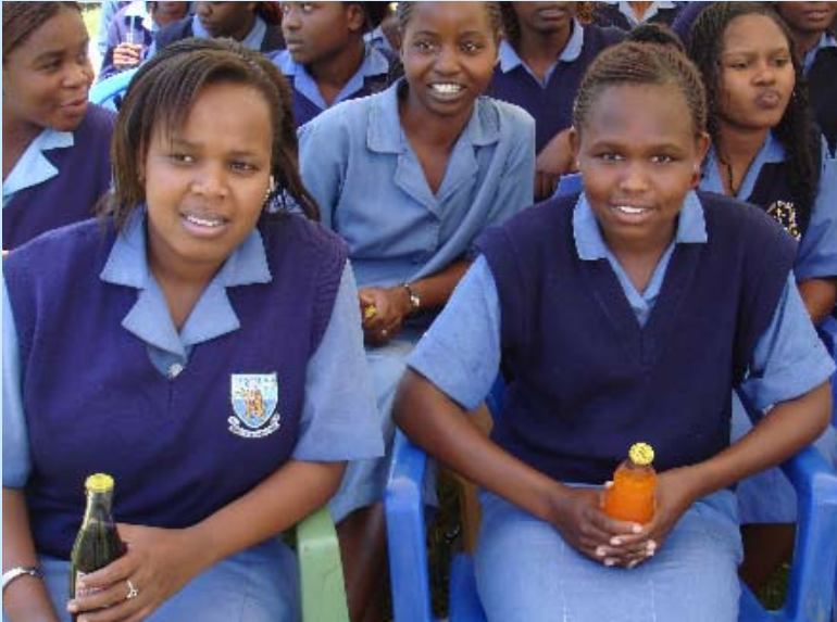
Kakamega MTC students in a past event. The ISO certification has renewed commitment to high quality across the campuses.

I wish to thank the KMTC Board of Management, Management Team and all staff for their individual and collective effort that enabled KMTC get ISO 9001: 2008 certificate. A symbol of the College's commitment for high quality service provision to its stakeholders, the certification is in the scope of training of health professionals.