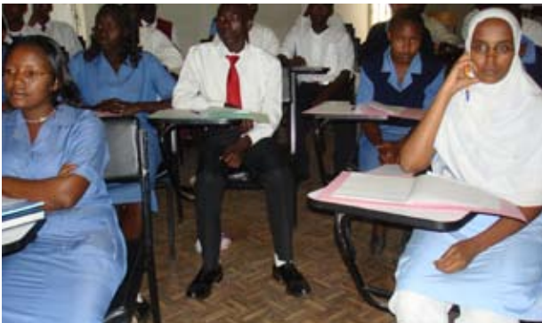
Some students' leaders in a training seminar in Nairobi. An annual luncheon was held to honour the leaders and students

The Nairobi MTC community held their annual luncheon on June 18.