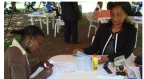
A lecturer at Kisumu MTC admits a student. Staff will get new benefits

KMTc staff can now access loan on discounted terms and conditions following an agreement reached between the National Bank of Kenya (NBK) and the College.