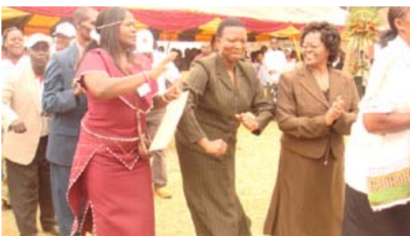
Putting the best foot forward: College staff celebrate ISO 9001: 2008 certification with song and dance.