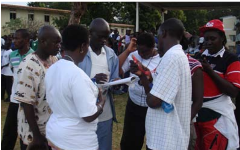
Some KMTc staff consult during the recent KMTc championships held in Mombasa. The College has started a course to improve performance and commitment

KMTc held a two week workshop from July 6th-17th 2009 to develop training manuals for a newly introduced short course, Performance Improvement Approach (PIA).