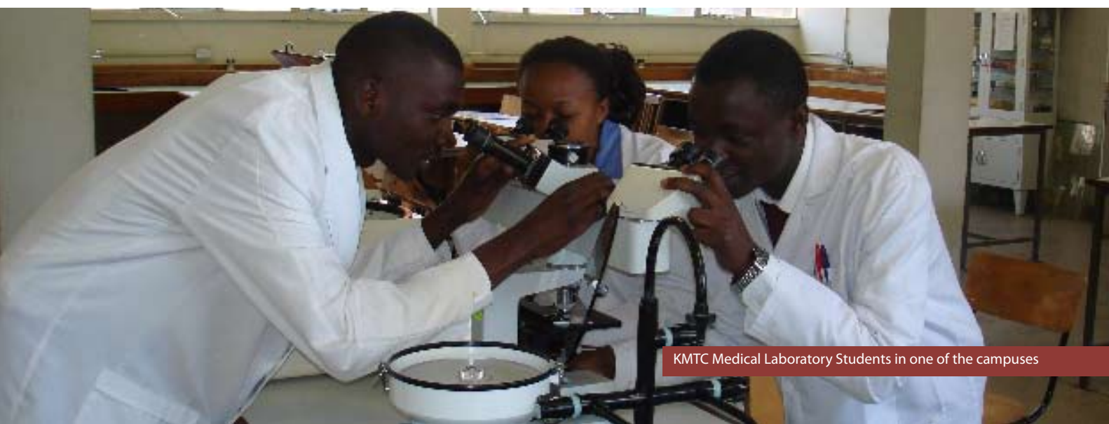
KMTC Medical Laboratory Students in one of the campuses