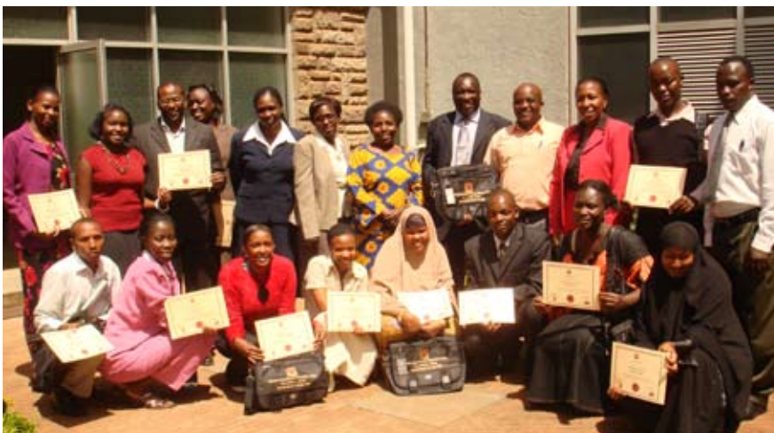
Trainers and participants of a short course display certificates awarded to them after training. The College is sensitising stakeholders on the short courses available at KMTC

A workshop was held in July to sensitize stakeholders on KMTC’s newly introduced short courses.