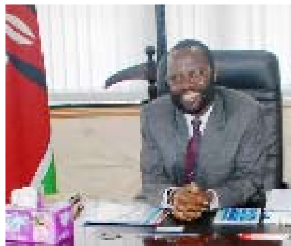
Prof. Anyang Nyong'o, Minister for Medical Services

Once again, congratulations to the College in achieving ISO 9001:2008 Certification.